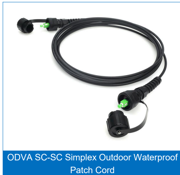
ODVA SC-SC Simplex Outdoor Waterproof Patch Cord